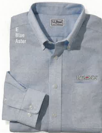
E Blue Aster