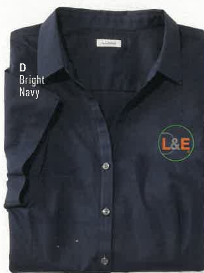
D Bright Navy