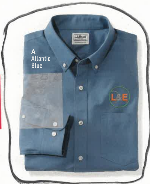
A Atlantic Blue