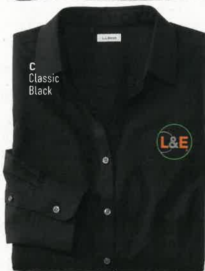
C Classic Black